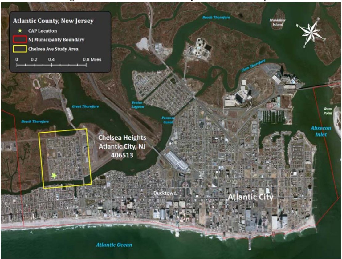
Figure 2: Location of the Chelsea Heights Study Area within Atlantic City.